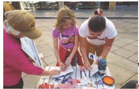
Colorado's support for their efforts in defense of our nation and appreciation for their sacrifice.

Though there's room and desire for much growth, happily there have already been some