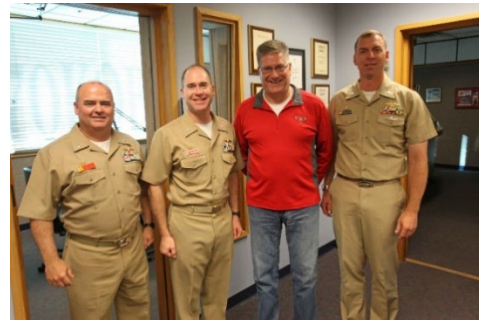
Three COs with Radio Talk Show Host