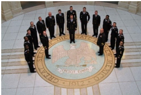
Three Crews in Capitol Rotunda

On one rare occasion in October 2014, the ship schedules lined up perfectly and the Sub Clubs managed to get all three COs plus 5 or 6 crew members from each boat in NM at the same time. Activities included radio & TV interviews, reception with the Governor, photo ops in the State Capital, balloon rides, and a Wild West visit to a movie ranch.